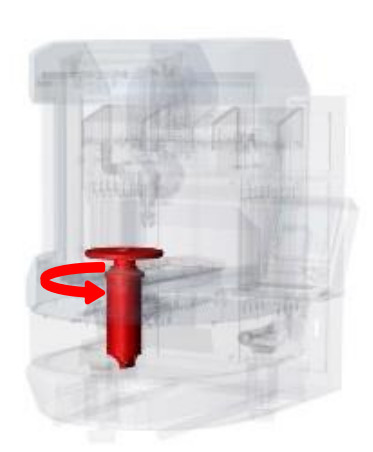
Figure 8: C Axis/Spindle

The C Axis forms the work piece mounting spindle and is mounted to the Y-Axis. The axis consists of rolling element bearings driven by a Brushless DC servo motor, with positional feedback provided by a precision absolute encoder. Spindle is cooled by external SMC chiller system.