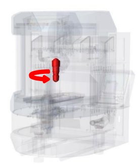
Figure 5: A Axis