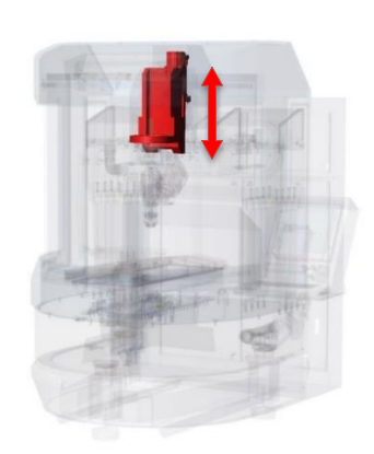
Figure 2: X Axis