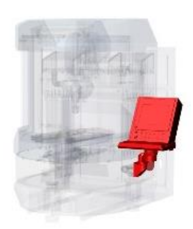
Figure 9: Control Console